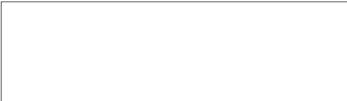
Figure 1: Title (Source)